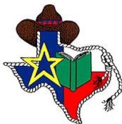
Lone Star (Gr. 6-8)

http://www.txla.org/sites/tla/files/groups/yart/docs/Maverick/docs/2012mavlist.pdf