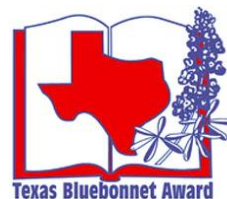
Texas Bluebonnet Award (Gr. 3-6)

http://www.txla.org/sites/tla/files/groups/yart/docs/LoneStar/docs/2012lonelistannotated.pdf